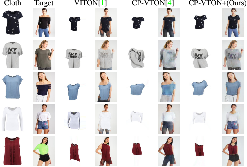
Figure 1. Qualitative evaluation of image-based VTOns (new clothing try-on): left to right, input pairs, VITON results, CP-VTON results, CP-VTON+ (ours) results). We present examples of different type of clothes here: from sleeveless to short, half and long sleeve, with different human body shapes/poses. Our method correctly preserves original clothing shapes, textures, and target human reserved regions.

background and the body shape is often distorted by hair occlusion. We correct this as follows: A new label ‘skin’ is added to the label set, and then the label of corresponding area is restored from the wrong label, ‘background’, considering the original human image and joint locations. The skin-labeled area is now included in the silhouette in the human representation. To recover the hair occlusion over the body, first the hair occlusion areas are identified as the intersection of the convex contour of the upper clothing and the hair-labeled area, and the intersections are re-labeled as upper cloth.