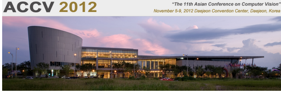
Fig. 1. The website of ACCV 2012 is at http://www.accv2012.org . Accompanying workshops are listed on http://www.accv2012.org/sub/sub02_02.html . If images are copied from some source then provide the reference. Follow copyright rules as they apply. A caption ends with a full stop.